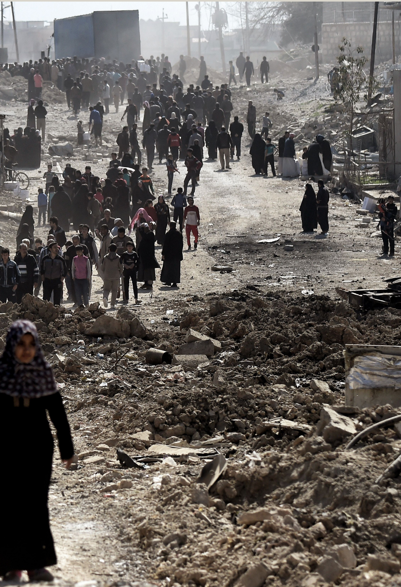
People walk in western Mosul after the city was seized from ISIS.