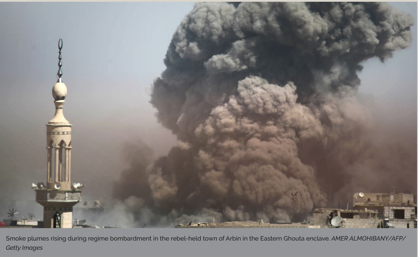
Smoke plumes rising during regime bombardment in the rebel-held town of Arbin in the Eastern Ghouta enclave.

the Syrian people is jihad and is resistance to a tyrannical regime and whomever stands with it.” 33