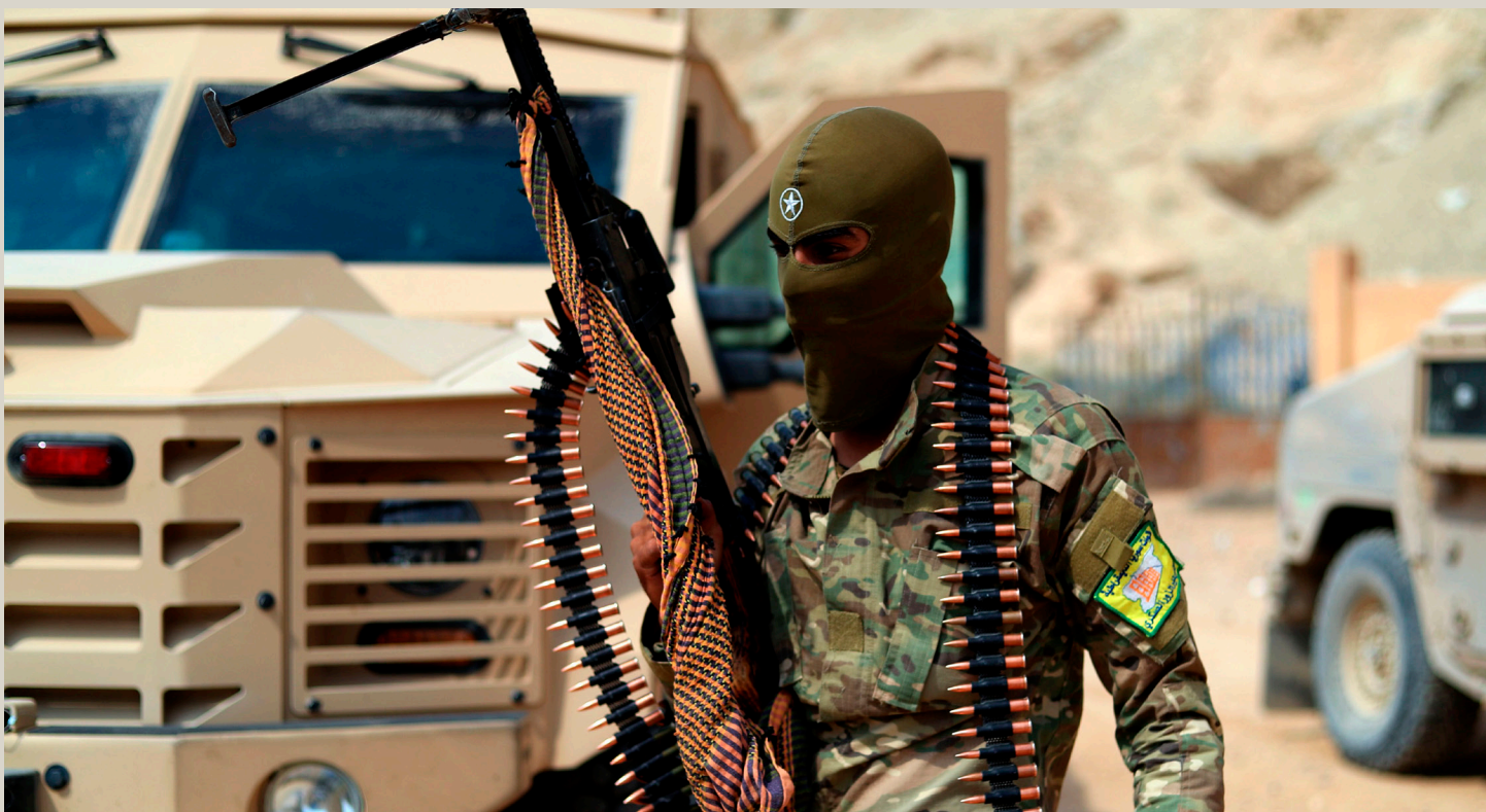
A member of the Syrian Democratic Forces (SDF) carries his weapon after ousting ISIS jihadists from the town of Hajin.

That became even more obvious when further pictures of Jolani were released in early 2018 almost immediately after Hay'at Tahrir al-Sham (HTS)—which Jolani led after Jabhat Fateh al-Sham ceased to exist—lost the Abu al-Duhur Military Airbase. Located in Idlib governorate, the capture of the base had been one of the group's (then Jabhat al-Nusra) most significant victories in the province. HTS had been widely criticized for not putting up enough resistance and withdrawing from the base, essentially gifting it back to Assad. Within days, pictures were released of Jolani on the front lines, talking to his men and rallying the troops for their next fight.