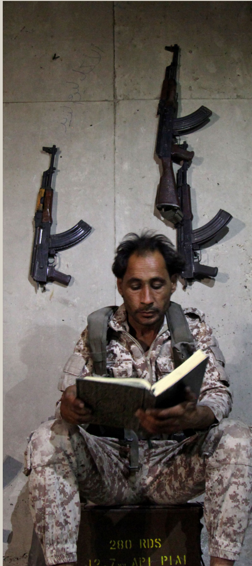
A Syrian rebel fighter reads the Qur'an as he sits in a fortified position held by a rebel group.

With the exception of Tartusi, the presence that these clerics had inside Syria invested their opposition to the regime with authority. Their hopes of inserting religious scholars in each of the revolutionary military councils were dashed as the potency of their influence faded along with their detachment from the conflict. For example, for those on the ground, Moaz al-Khatib eventually came to exemplify the kind of pragmatism that only those divorced from the everyday privations of the conflict could allow themselves. While the exiled leadership was already causing resentment because of their relative security and proclivity for conferences in comfortable hotels, Khatib issued a statement on Facebook in 2013 saying that he was ready for dialogue with the regime to bring the crisis to an end. 19 The statement was met with immediate and widespread uproar. Even the National Coalition, whose presidency Khatib had resigned by that stage, issued a statement distancing itself from his remarks for fear of losing their support base inside the country.