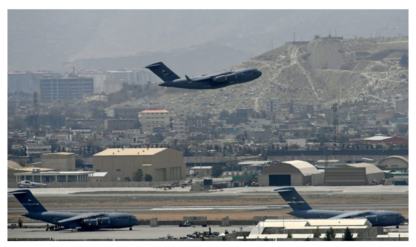
Photo above: A U.S. Air Force aircraft takes off from the airport in Kabul on Aug. 30, 2021, two weeks after the Taliban reentered the city.

The benefits of America's departure were that it freed up some military and intelligence resources for the broader competition against Russia and China. It also helped shift America's national attention beyond the post-9/11 period that dominated U.S. foreign policy for two decades. But those benefits were frequently overstated by the Biden administration, with the decision to