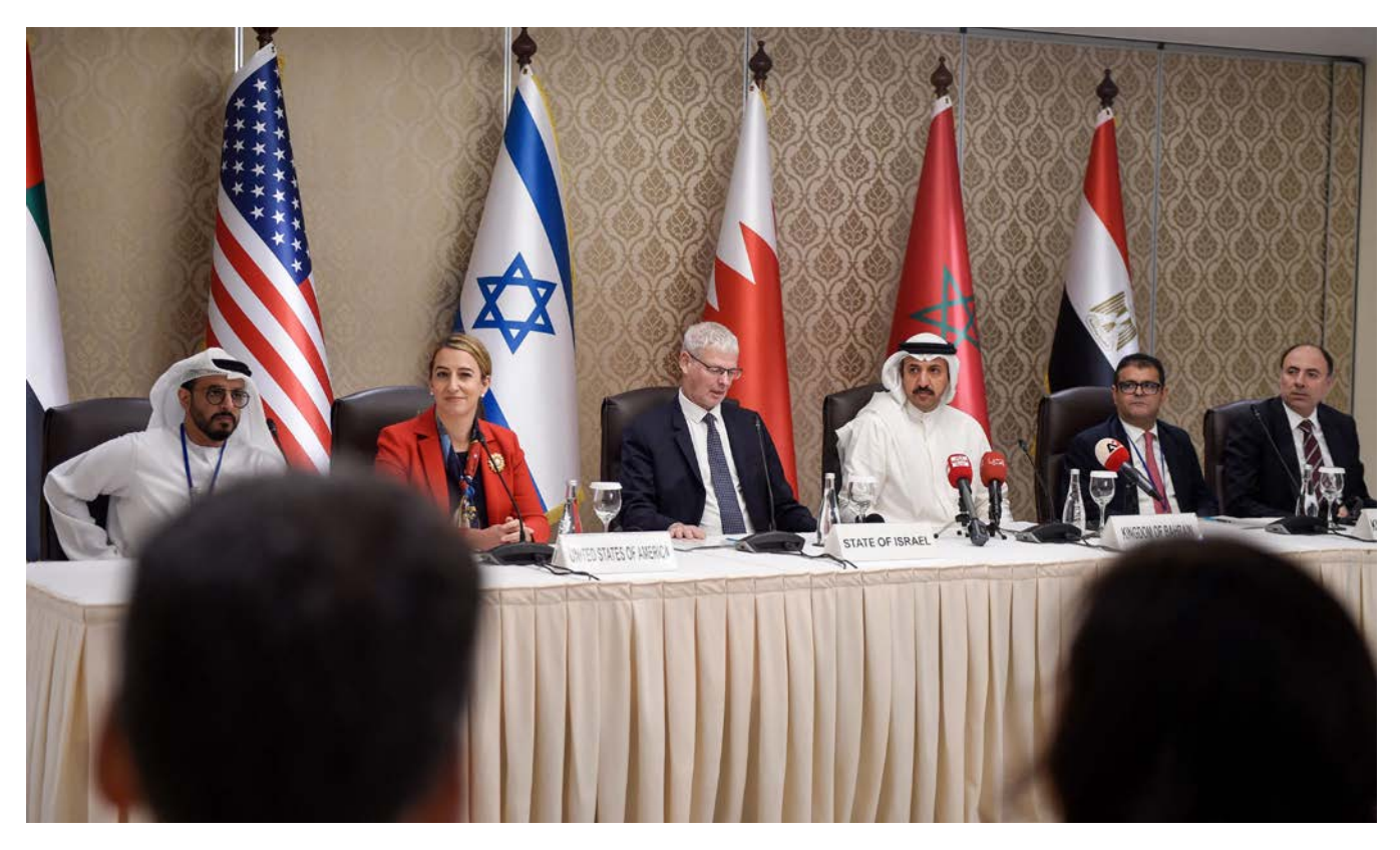
Photo above: The joint press conference of the first Negev Forum Steering Committee meeting in Bahrain, June 27, 2022.

• The Negev Forum working group meeting organized in January 2023 in the UAE was touted by a senior <u>Biden official</u> as "the largest gathering of Arab and Israeli officials since the Madrid process" in the 1990s. The effort seeks to promote regional integration in several important <u>areas</u>, such as regional security, education and tolerance, water and food security, tourism, and energy.