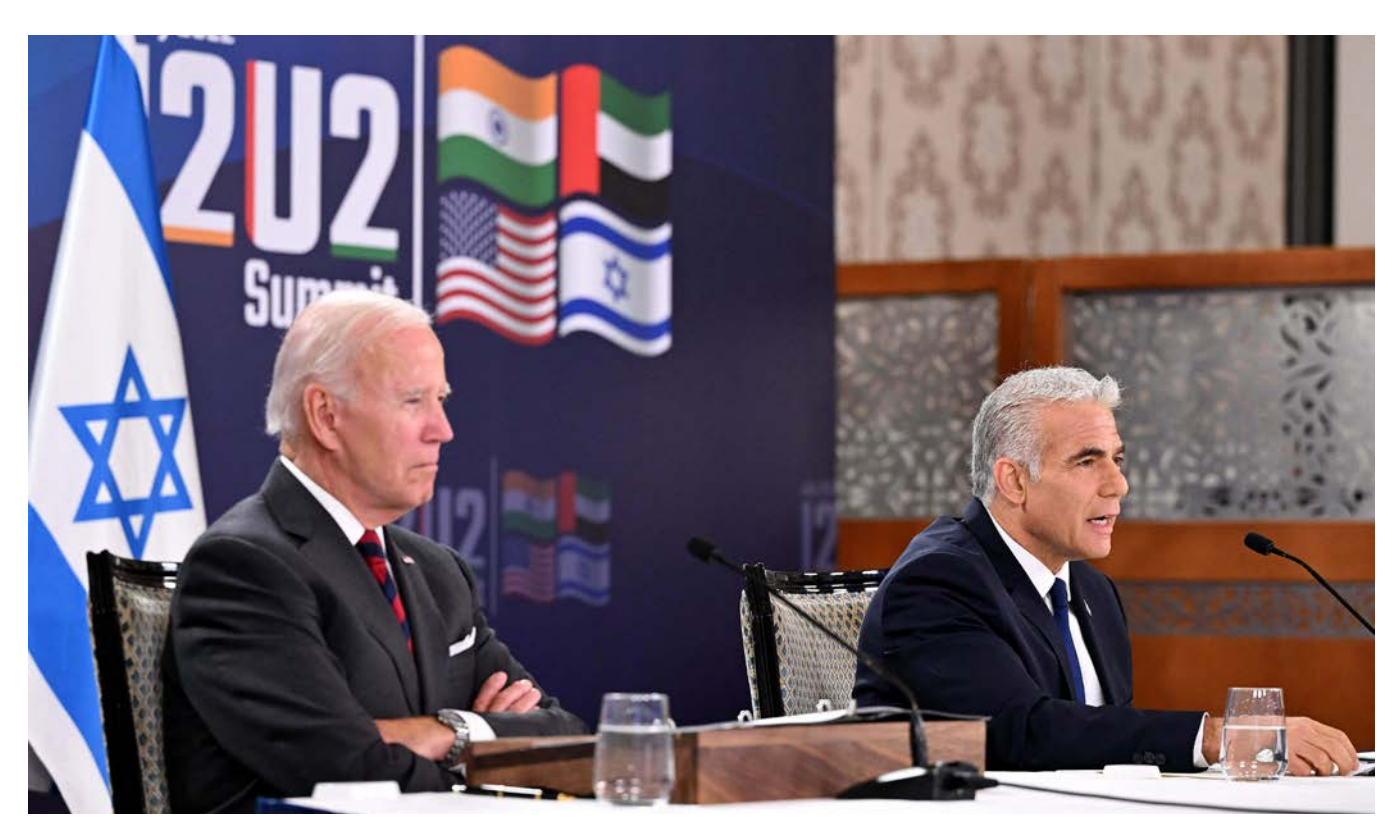
Photo above: U.S. President Joe Biden and Israel's caretaker Prime Minister Yair Lapid attend a virtual meeting with leaders of the I2U2 group, which includes, the U.S., Israel, India, and the UAE, in Jerusalem, on July 14, 2022.

between the militaries of the U.S. and Russia in Syria raise a red flag about how conflicts and tensions between outside powers might undercut regional stability and spill over to neighboring regions. In addition, China's steady stepped-up engagement in key parts of the Middle East presents a possible risk of destructive, zero-sum competition between Beijing and Washington.