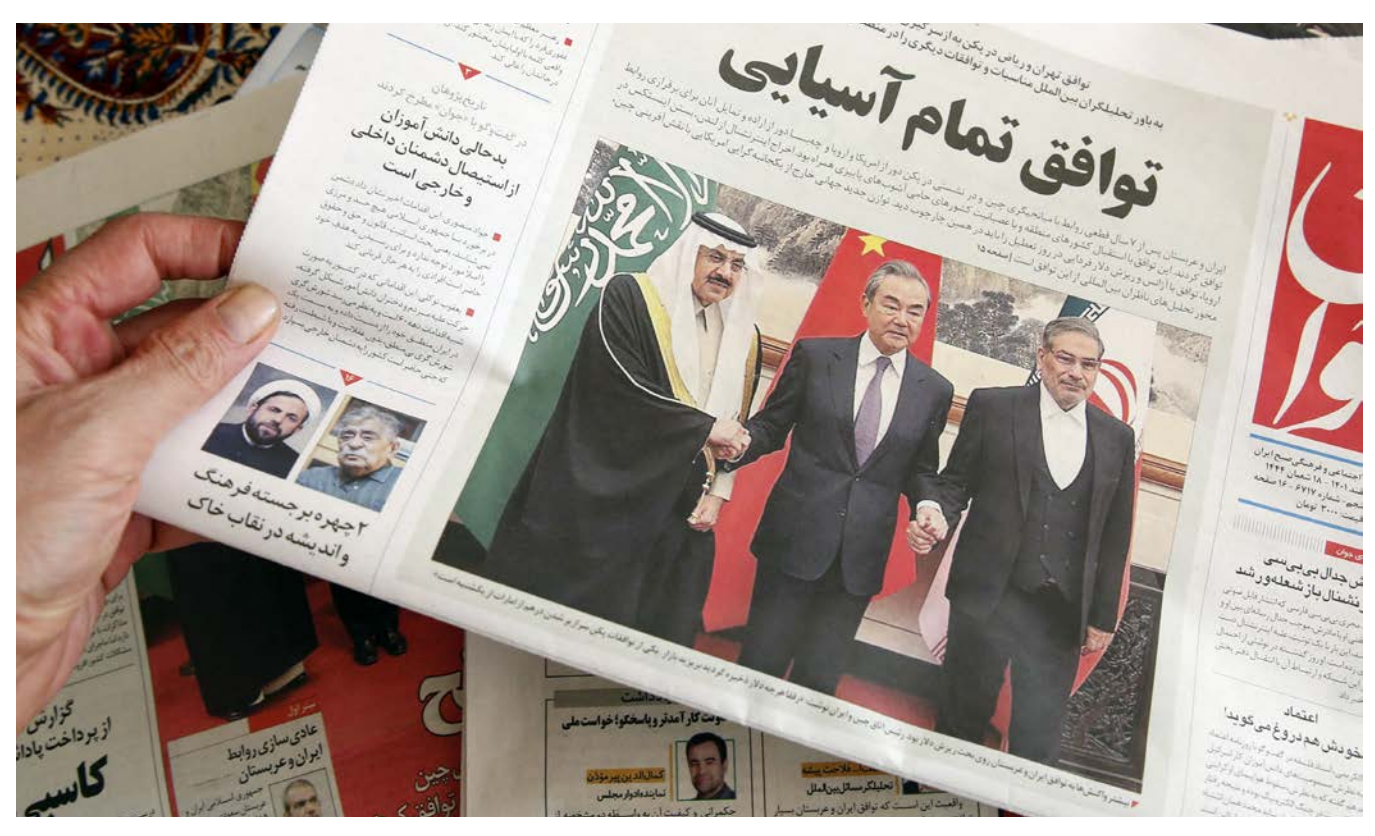
Photo above: A man in Tehran holds a newspaper reporting on the China-brokered deal between Iran and Saudi Arabia to restore ties, signed in Beijing the previous day, on March 11, 2023.

mid-2023. The fact that China played such a visible role in finalizing and announcing the March 2023 Iran-Saudi Arabia normalization agreement served as a wake-up call for the Biden administration, which had placed rivalry with China high on its broader foreign policy agenda for the whole world.