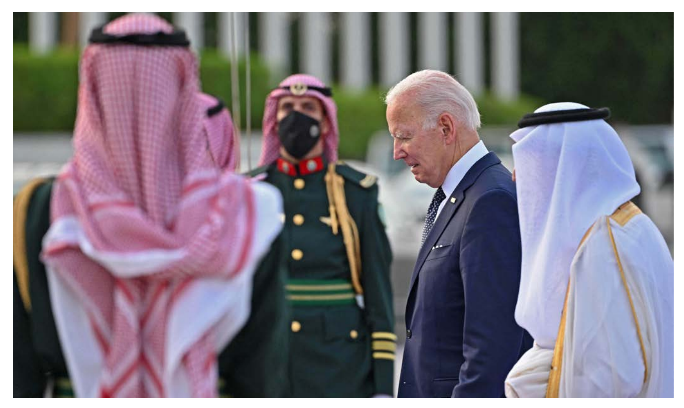
Photo above: U.S. President Joe Biden arrives at the King Abdulaziz International Airport in the Saudi coastal city of Jeddah, on July 15, 2022.

ministers with Israel's foreign minister to discuss ways to build on the regional normalization and integration trends set into motion by the 2020 Abraham Accords as well as consider practical cooperation on human security issues. Blinken took part in this forum after a series of meetings with Palestinian leaders, including Palestinian Authority President Mahmoud Abbas, and civil society, but the Palestinians remained outside of the process.