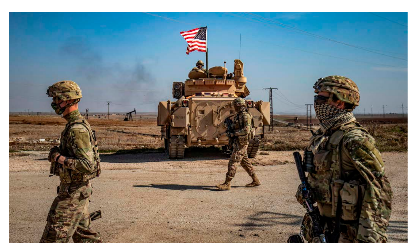
Photo above: U.S. soldiers patrol the Suwaydiyah oil fields in Syria's northeastern Hasakah province, Feb. 13, 2021.

Israel and Arab states, including the UAE, Bahrain, Morocco, and Sudan.